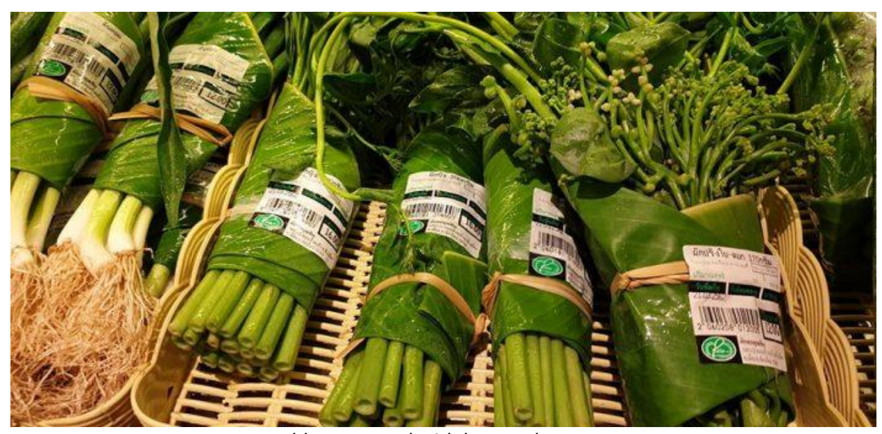
Vegetables wrapped with banyan leaves

The fight against plastic is getting momentum. In a historic development, the New York State Assembly approved legislature banning plastic items intended for one-time use, such as plastic bags and utensils. These steps "from above" are of course essential for confronting the plastic threat. However, initiatives "from below" are also necessary. Further, even government steps from above cannot be successful unless people support them through their own actions.