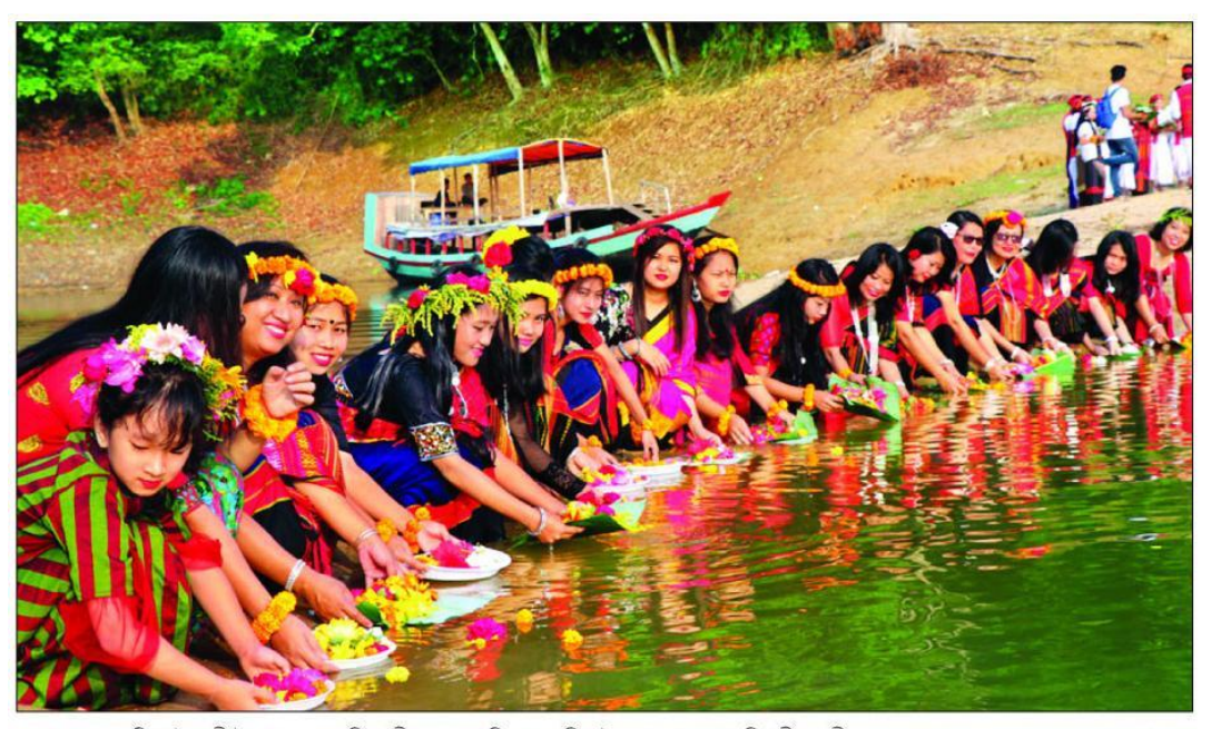
শুক্রবার রাঙামাটিতে বৈসাবী উৎসবের প্রথম দিন নদীতে ফুল ভাসিয়ে ফুল বিজু উদযাপন করেন আদিবাসী তরুণীরা